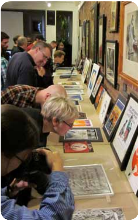
Critique at Society of Illustrators in New York City

Students should assume additional expenses for transportation to and from contact period locations, hotels, meals, art supplies and car rentals.