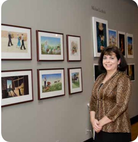
Student at her Thesis Exhibit