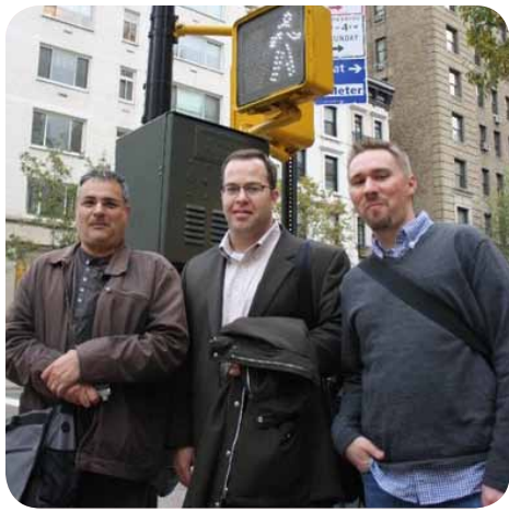
Students in New York City during Contact Period

This MFA in Illustration program has brought some of the best illustrators from around the country together to push and challenge their students to be the best they can be. The program offers the best in overall quality and flexibility for working illustrators. I could have never obtained my MFA if it wasn't for this program... and what a program!