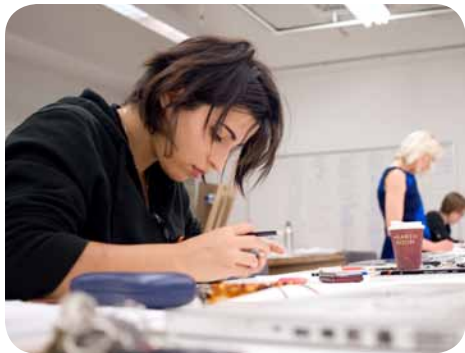
Student working on her assignment in class